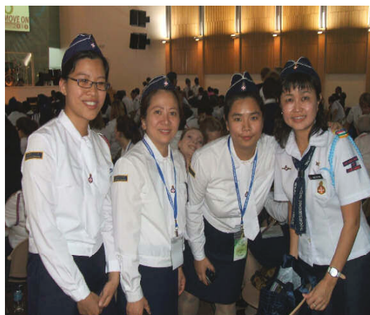
Members from Girls' Brigade Hong Kong enjoying the conference