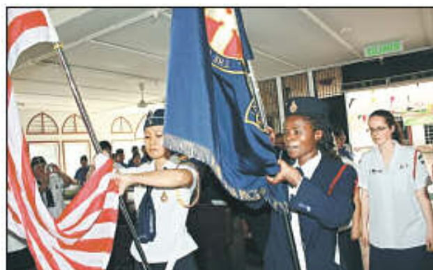
Crossing Over: GB Emerging Leaders proudly carrying ‘the colours’ during the ICGB’s closing service.