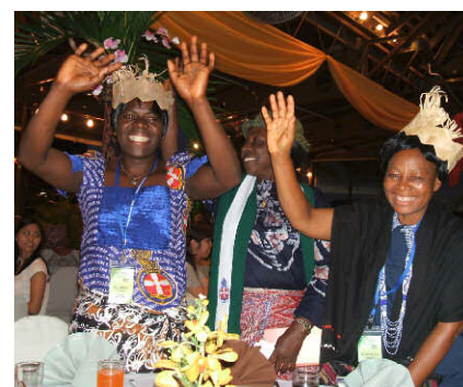
Members enjoying the celebrations